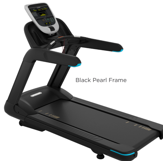
Black Pearl Frame

Refined colorways with dark Tungsten covers and two frame color options.