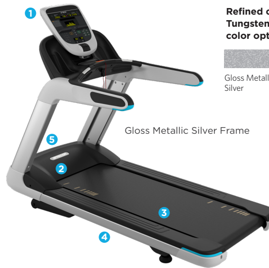
Gloss Metallic Silver Frame

To increase uptime, an external status light lets you and your staff know at a glance the operating condition of your treadmill and when to perform life-extending maintenance.